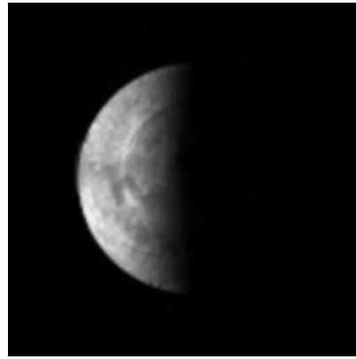
VMC greyscale image

Venus Express fired its main engine to enter Venus orbit on 11 April 2006 and is now in the first 9-day capture orbit taking it to apocentre (maximum height) at 350 000 kilometres below the south pole. It will swing back up to pass pericentre (minimum height) at an altitude of 250 kilometres over the planet's north pole.