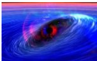
Artist impression of hot gas orbiting a black hole. (Dana Berry/CfA/NASA)